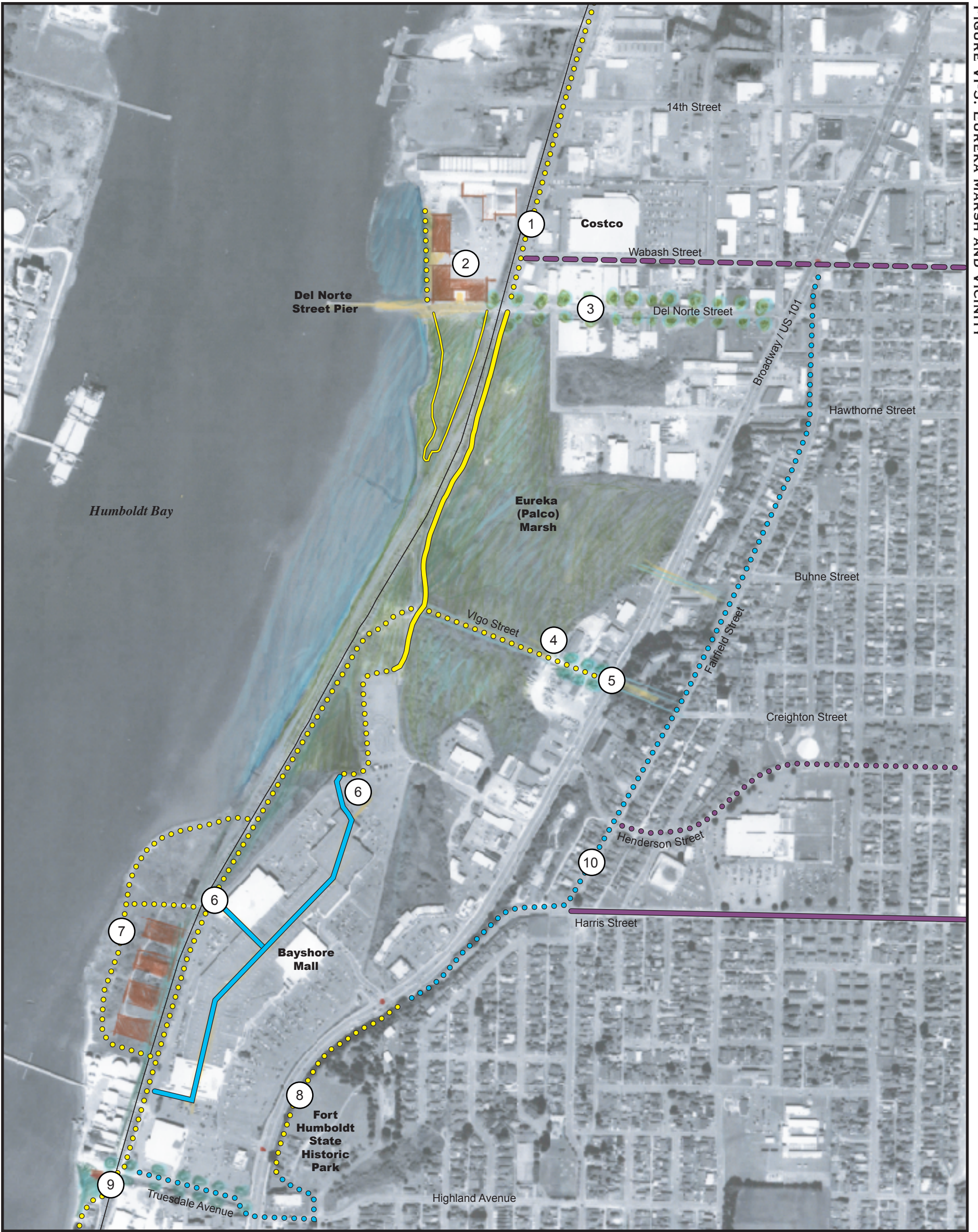
FIGURE VI-5. EUREKA MARSH AND VICINITY